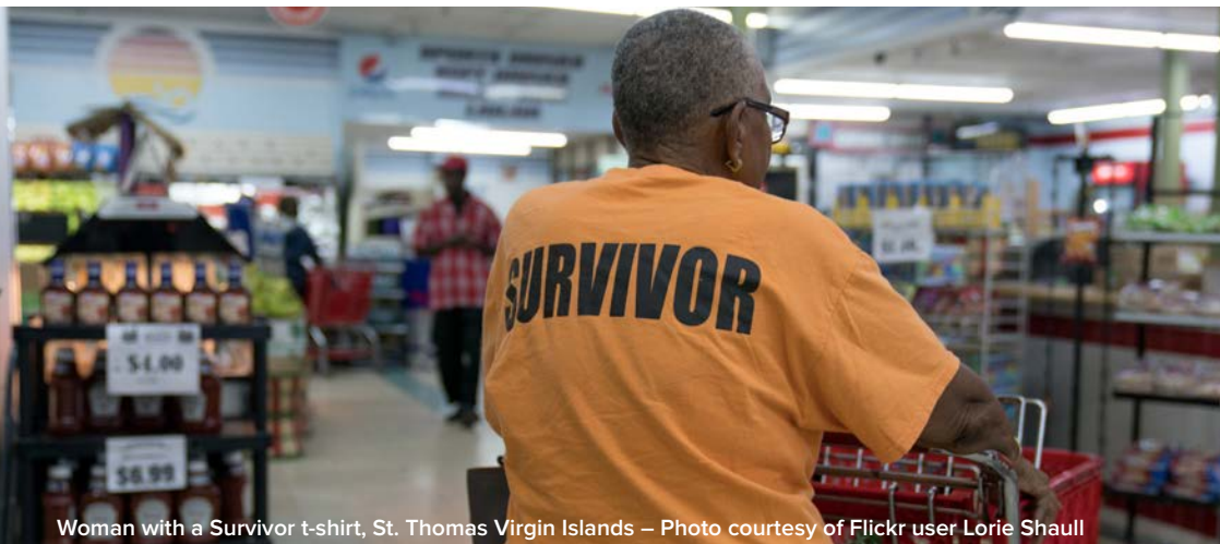
Woman with a Survivor t-shirt, St. Thomas Virgin Islands

Within the Administration for Children and Families , there are 13 program offices, and OCSE is one of only five that have mission essential functions. We are working with ACF's Office of Human Services, Emergency Preparedness, and Response (OHSEPR) to ensure that ACF's and our Continuity of Operations Plans are accurate. We will test the plans later this year during an HHS exercise. In regular meetings with OHSEPR, we are reviewing lessons learned from previous emergency events, some of which may help inform your assessment.