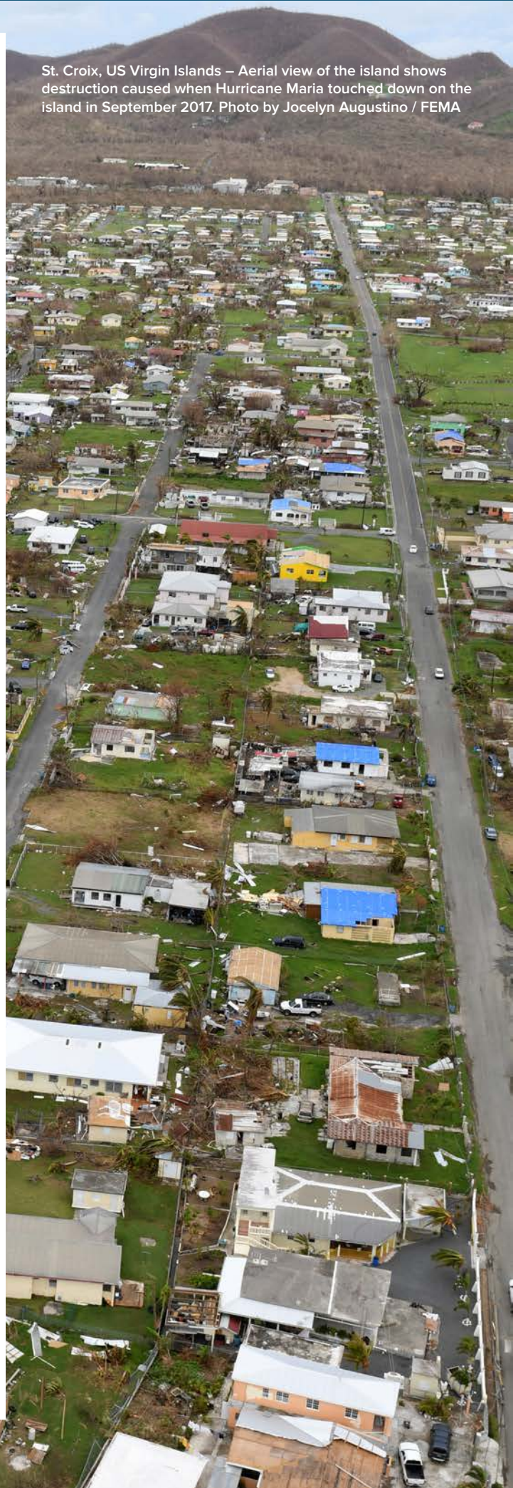
St. Croix, US Virgin Islands – Aerial view of the island shows destruction caused when Hurricane Maria touched down on the island in September 2017.